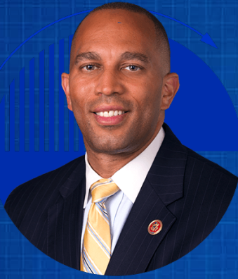
CONGRESSMAN HAKEEM JEFFRIES

Eighth Congressional District of New York